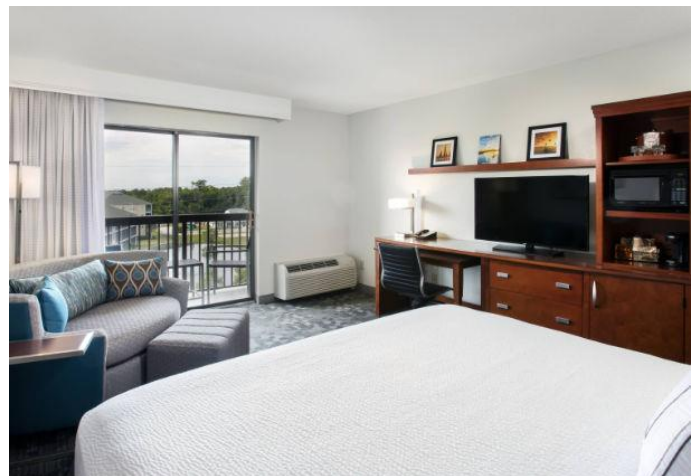
The newly renovated suites are full of clean lines and bright whites bringing to life the lush greenery and natural beauty of Barefoot Landing.

Most guests assume Barefoot Landing hotels will be limited to vacation travelers. The Courtyard Myrtle Beach Barefoot Landing and the renovations to its lobby, public, and meeting spaces challenge that assumption, and invite business travelers to enjoy versatile social spaces, access free Wi-Fi, and fuel-up for morning meetings at the on-site Bistro, serving Starbucks coffee.